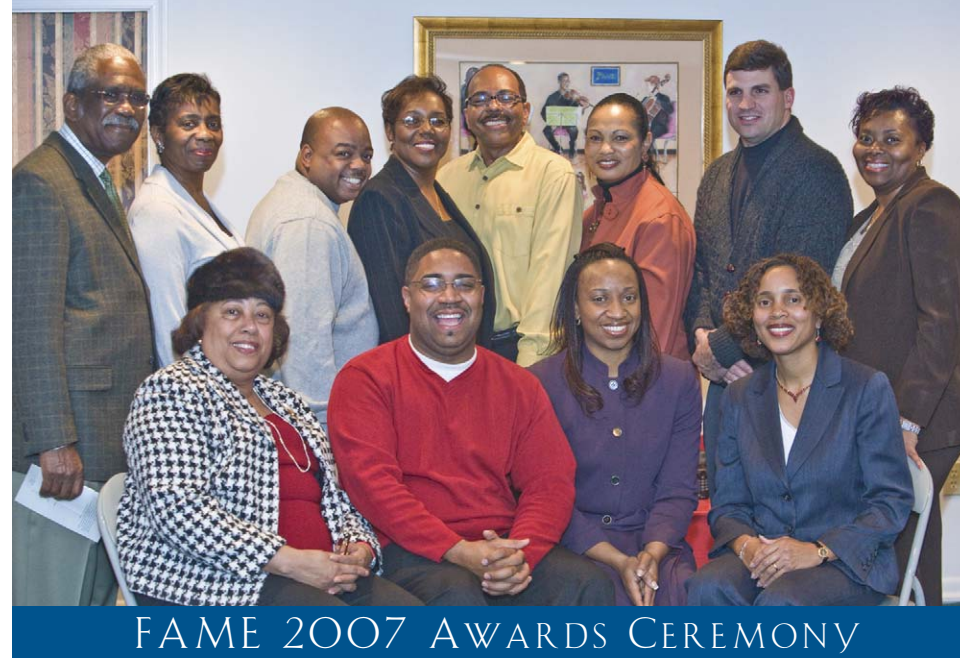
The 2007 FAME Awards Ceremony was held on December 8, 2007, at FAME's Headquarters in Bowie, Maryland. Each recipient gave overviews of their organizations to attendees and received a $2000 FAME grant to support their nonprofit efforts.

Innovative Study Techniques The Maryland Opera Society Dance Institute of Washington DC Boys Choir The Ottley Music School